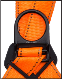
DORSAL D RING